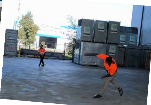
To break up the winter blues, the VIC team gathered at Truganina Despatch for a friendly game of cricket.